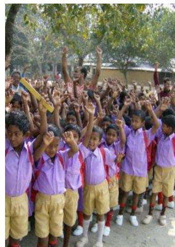
After DCI Support