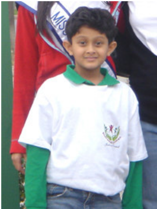
US Sponsoring Child

One of the goals of DCI is to educate American children about world hunger and poverty. Through the Sun Child Sponsorship program, American children have a unique opportunity to develop friendships with children in Bangladesh. Our hope is that these exchanges will promote cross-cultural understanding. We also believe that these children are more likely to become empathetic leaders in the future.