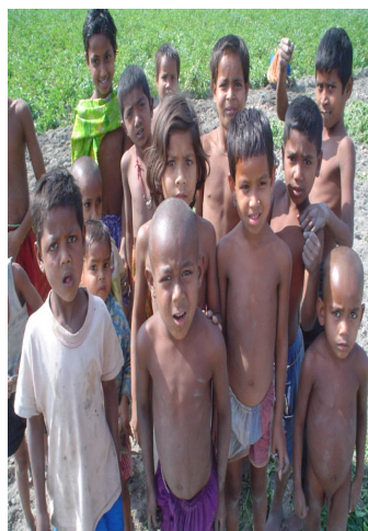
Before DCI Support